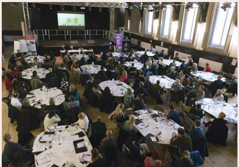
November's Third Sector Conference at Unity Works, Wakefield.

Four Third Sector Conferences have been organised since 2013. Each one has taken place in a different district with the support of the local CSP. The last event took place in Wakefield in November 2016 and attracted 140 delegates from across West Yorkshire. The event explored the sector's role in building the involvement of victims and offenders into the design of support services. Bringing partners together to share ideas and experience at these events draws-in vital feedback which helps the OPCC and its partners build better outcomes for victims across the county.