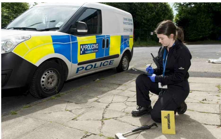
Regional scientific and forensic services are co-ordinated by West Yorkshire Police.

The National VIPER Bureau is utilised by the UK police to produce video identification (ID) parades. Video ID parades replace the old fashioned line-ups of suspects, removing the requirement to seek volunteers to stand on a parade, and for witnesses to confront a suspect face to face. Images of volunteers are pre-recorded and stored on the VIPER database and then shown alongside images of a suspect as part of a video ID parade. The short video clips can be played at a police station or at a witness's home. There are over 20 police forces in the UK which rely on VIPER to produce their video ID parades.