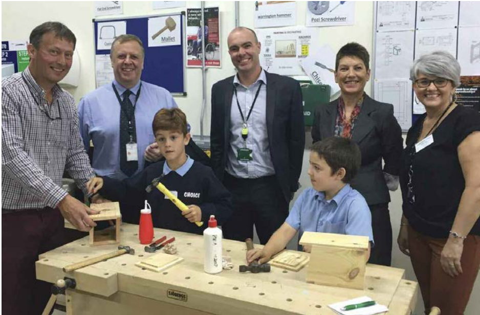
Pontefract Academies Trust received a SCF grant to support their engagement work with young people.