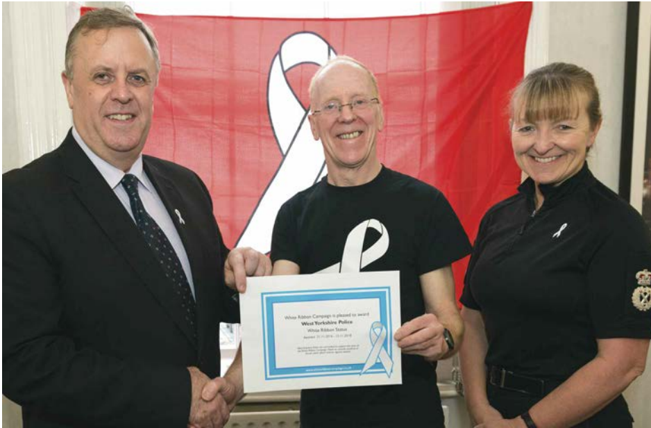
West Yorkshire Police received their White Ribbon accreditation at the beginning of the national 16 Days of Action Against Domestic Abuse campaign.