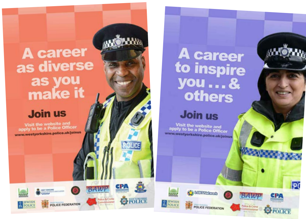
Building a police workforce which fully represents the diverse population of West Yorkshire is the objective of the Positive Action campaign

HM Inspectorate of Constabulary’s (HMIC) review of police services provides an independent annual assessment of how well police services are performing in their core responsibilities. Over three ‘PEEL’ reports, HMIC evaluate the police’s efficiency, legitimacy, and effectiveness. In 2016, West Yorkshire Police attained ‘Good’ grades in each of these three categories.