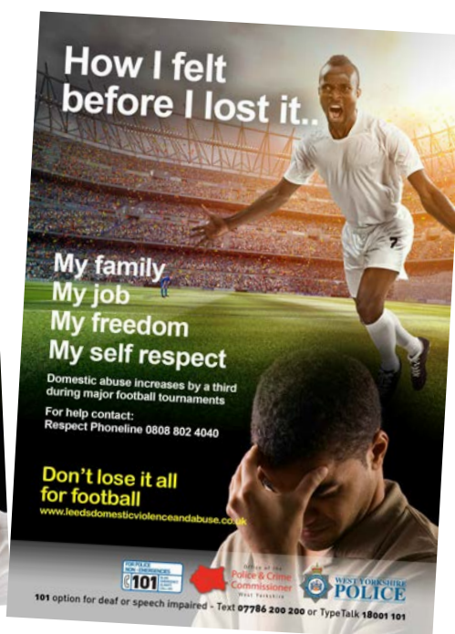
Domestic abuse campaign work to coincide with Euro 2016.

In 2017 the decision was taken to expand the West Yorkshire Domestic Abuse Board's remit to include sexual abuse. As some victims and survivors have experience of both issues, it is hoped that services can be enhanced by bringing together advisors and advocates with skills in both fields. The Ministry of Justice's Victim and Witnesses Fund includes an indicative allocation for victims and survivors of child sexual abuse, and this resource was used to support the establishment of the West Yorkshire Child Sexual Assault and Assessment Service. The service provides, for the first time, support for the immediate needs of victims wherever they live in West Yorkshire. Two other services which have benefitted from OPCC funding are West Yorkshire's first full Sexual Assault Referral Centre (SARC) , and Ben's Place .