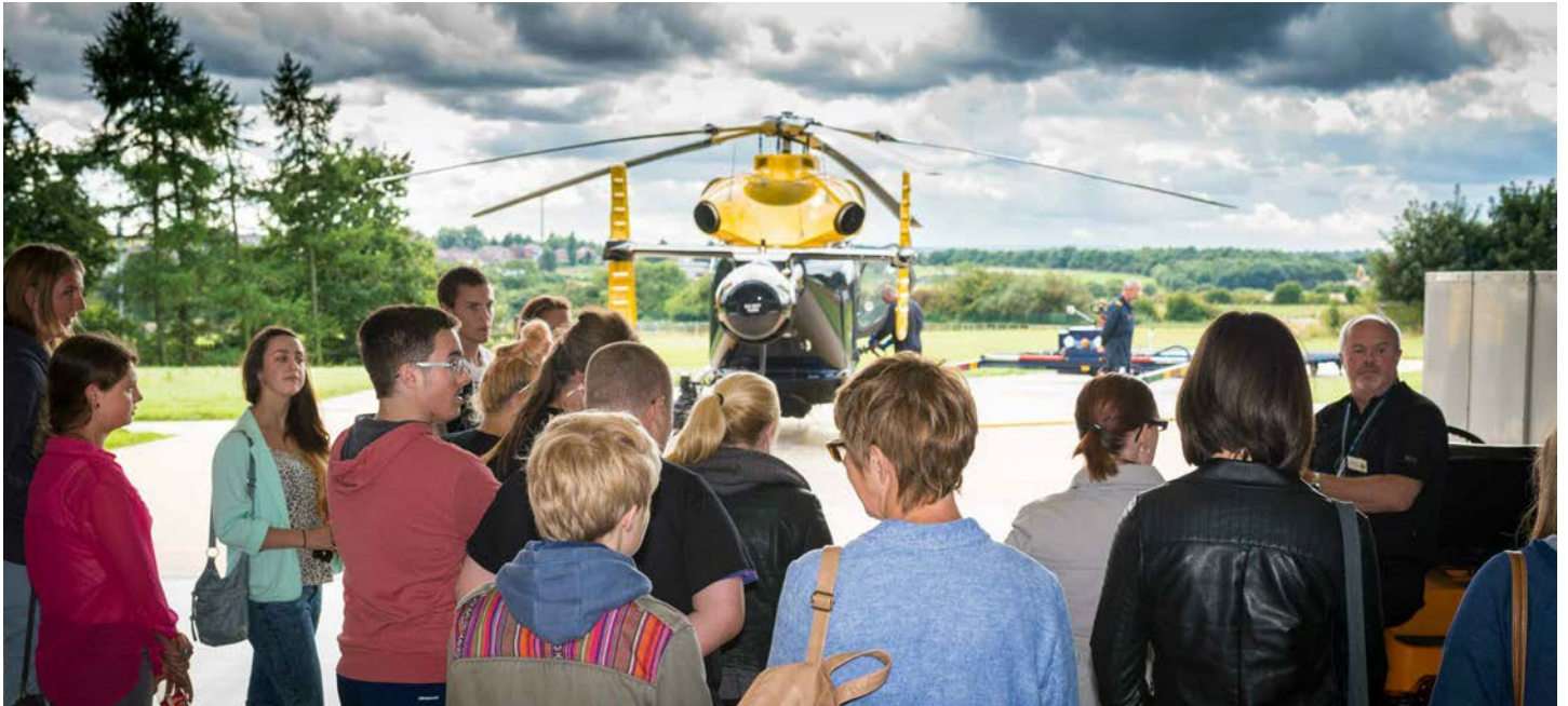
Members of the OPCC Youth Advisory Group visit the National Police Air Service base at Carr Gate.